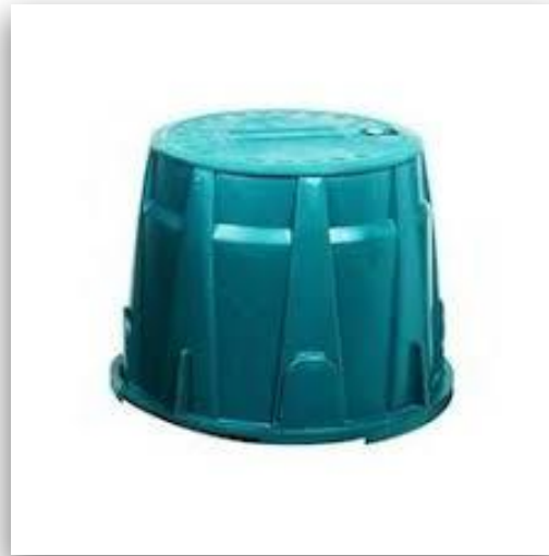
GREEN POLYPLASTIC ROUND PIT COVER

all rods clamps are made of brass or gun metal for corrosion less joint for different sizes are available, Made as per highest quality standards .