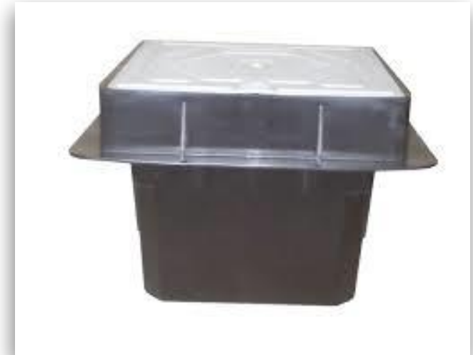
GREY-BLACK SQUARE PIT COVER

Green round 300x300 dimensions polyplastic pit covers are available. They are available in 5 tonnes weight resistant varieties as well. The [pit covers are ready to use & does not require maintenance at all. NABL Accredited lab test results for 1-minute weight resistance is available.