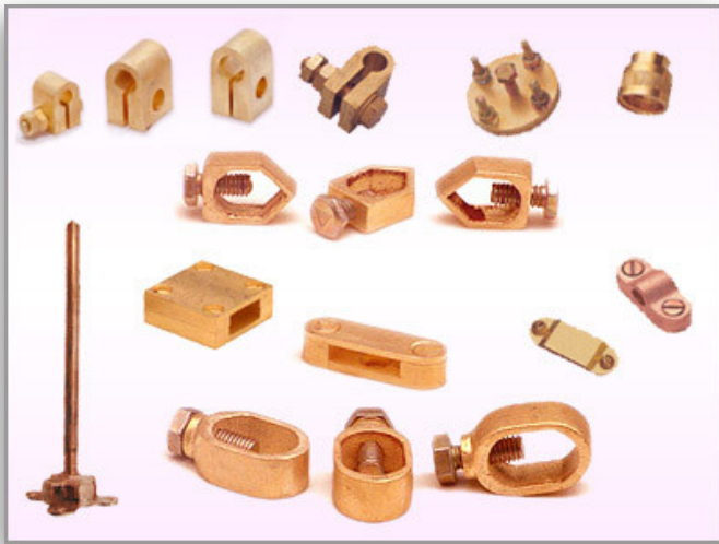
BRASS & GUN METAL ITEMS

all rods clamps are made of brass or gun metal for corrosion less joint for different sizes are available, Made as per highest quality standards .